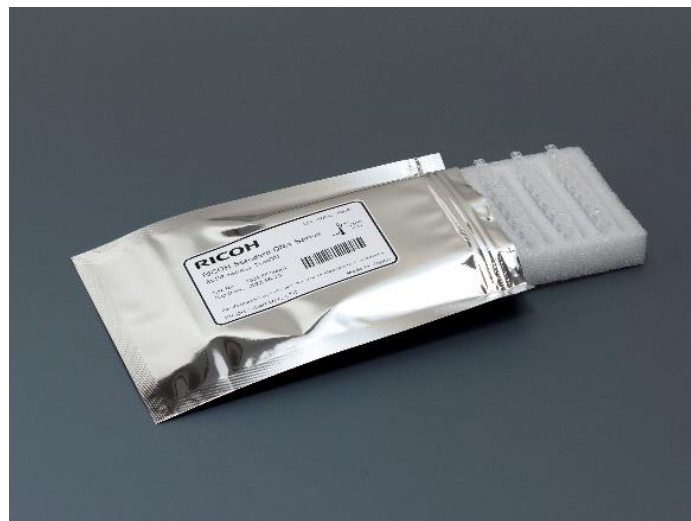
RICOH Standard DNA Series EGFR mutation Type001

※This product is a reagent for research use only.